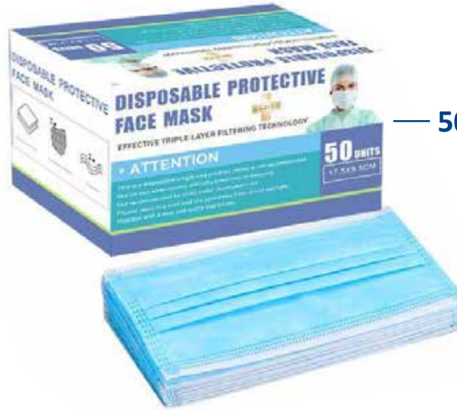
— 50 PCS Box

Lead Time & Delivery: in Stock New Jersey