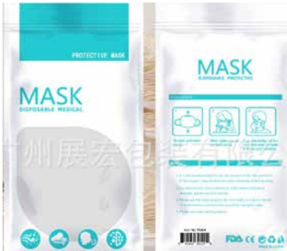
— 1PC Bag